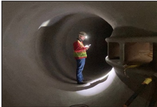
Scroll case and stay vanes after grit blasting.

As water transitions from laminar to radial flow mechanical/erosion damage occurs at leading edges of stay vanes and outer race of scroll case.