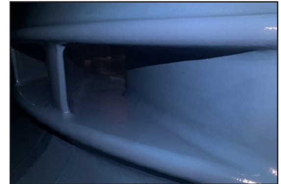
Final coat of ARC SD4i on stay vanes.

Client elected to coat second unit in a similar fashion in spring of 2022.